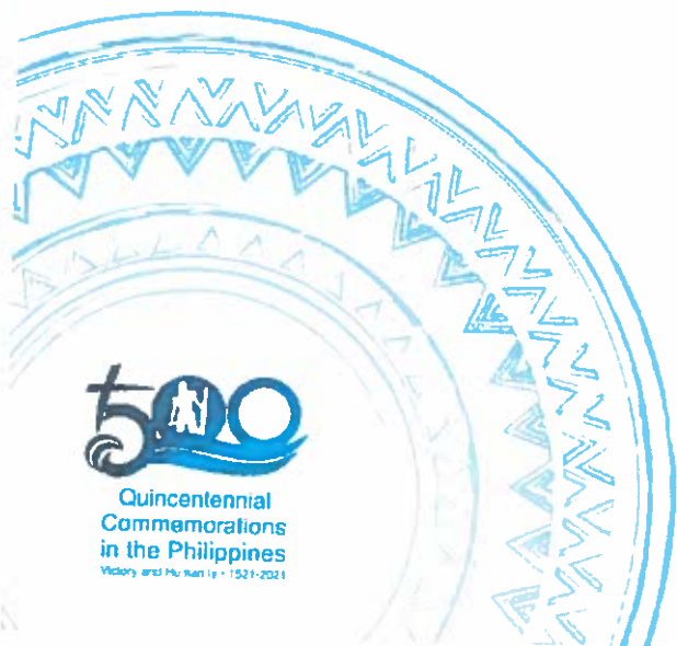
Michael L. Rama Mayor City of Cebu

GF LEGISLATIVE BUILDING, CEBU CITY HALL, 01 RIZAL STREET, STO. NINO, CEBU CITY 6000 TELEPHONE: (032) 253 2047 | (032) 266 1039 | EMAIL: mayormichaelrama@gmail.com